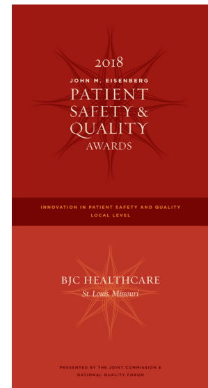
BJC HealthCare — Innovation in Patient Safety and Quality at the Local Level