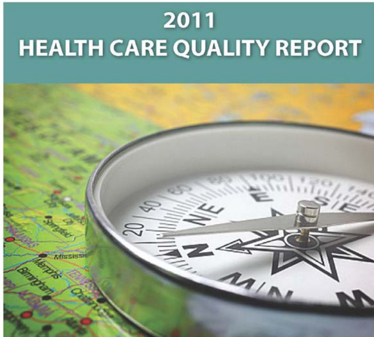
Comparative Data on Clinic, Medical Group and Hospital Performance