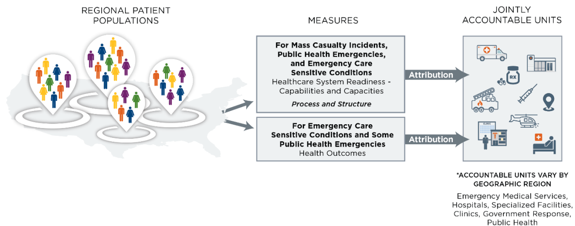
Figure 1. Geographic Attribution Approach for Mass Casualty Incidents, Public Health Emergencies, and Emergency Care-Sensitive Conditions

Figure 1 represents several key principles of the attribution approaches outlined in this report. It illustrates accountability for regional patient populations through measures that hold regions jointly accountable for MCIs PHEs, and ECSCs. Process and structure measures (e.g., readiness measures prior to and during an event) are prioritized for quality measurement attribution for MCIs, PHEs, and ECSCs. Health outcomes can be tracked for ECSCs and some PHEs for the jointly accountable units. Examples of accountable units within a geographic region are included; accountable entities may vary by geographic region.