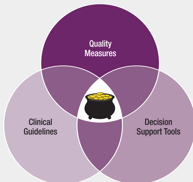
FIGURE 1 The "Sweet Spot"

This vision of a smart performance measurement, reporting, and clinical decision system is achievable, but it requires the standardization of terms and technical specifications for the quality dataset. It also requires the collaboration and cooperation of the quality community and the EHR community to develop standardized terminology and technical specifications for the quality dataset, which should be updated frequently to reflect changes in the content or specifications of performance measures in the NQF portfolio.